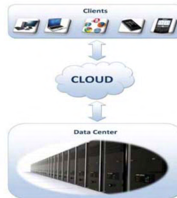
Fig. 1 Cloud computing [1]

Cloud computing has become one of the hottest buzzwords in the IT area. Many companies and institutions are rushing to define clouds and provide cloud solutions in various ways. [1]Cloud computing is Internet-based computing, whereby shared resources, software, and information are provided to computers and other devices on demand, like the electricity grid. Due to the fact it involves the existence of data centers that are able to provide services; the cloud can be seen as a unique access points for all requests coming from the world wide spread clients. [19]